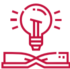
study skills coaching

The Carolina Centre can help you to access the following services: